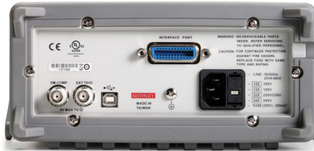
Model 2110 rear panel.

INPUT BIAS CURRENT: <30pA at 25°C. INPUT PROTECTION: 1000V all ranges (2W input). AC CMRR: 70dB (for 1kΩ unbalance LO lead). POWER SUPPLY: 100V/120V/220V/240V. POWER LINE FREQUENCY: 50/60Hz auto detected. POWER CONSUMPTION: 25VA max. DIGITAL I/O INTERFACE: USB-compatible Type B connection, GPIB (option). ENVIRONMENT: For indoor use only. OPERATING TEMPERATURE: 0° to 40°C. OPERATING HUMIDITY: Maximum relative humidity 80% for temperature up to 31°C. STORAGE TEMPERATURE: –40° to 70°C. OPERATING ALTITUDE UP TO 2000 M ABOVE SEA LEVEL. BENCH DIMENSIONS (WITH HANDLES AND BUMPERS): 107 mm high × 252.8 mm wide × 305 mm deep (3.49 in. × 9.95 in. × 12.00 in.). WEIGHT: 2.23 kg (4.92 lbs.). SAFETY: Conforms to European Union Low Voltage Directive, EN61010-1. Measurement Cat I 1000V and CAT II 600V. EMC: Conforms to European Union Directive 89/336/EEC, EN61326-1. WARRANTY: One year.