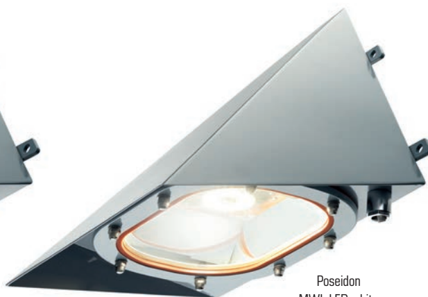
Poseidon MWL LED white